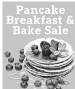
Pancake Breakfast & Bake Sale

Our Lady of Mount Carmel Church, Balta, will be serving a pancake breakfast at the Rugby Eagles on Sunday, April 26. They will be serving pancakes, sausage, eggs, coffee, and juice from 9:00 AM - 1:00 PM. A bake sale will also be held, featuring a variety of homemade treats. Everyone is welcome. Come and enjoy good food and fellowship.